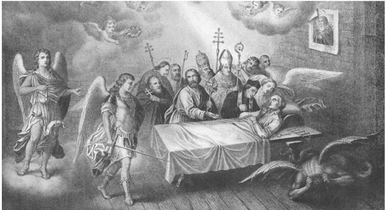
The Peaceful Death of the Just, 19th century lithograph

not force us to love him. He wants us to spend eternity with him — but the choice is ours. We have the chance to turn to Jesus while we are alive, but at the moment of death, our choice is frozen, suspended forever in time (see CCC 1021). We either die in friendship with the Lord or we die out of his grace, in persistent rejection of his love to the end. A person who dies in a state of mortal sin has made a tragic, yet free choice — and will spend eternity separated from God by his or her own choice.