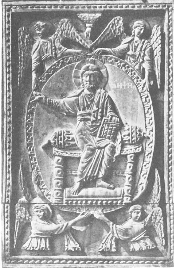
Jesus as Judge, 12th century carved ivory panel

a consoling positive reality; we do not have to die alone. The baptized Christian knows that his or her life belongs to Christ and that death is the physical completion of the “dying with Christ” that began at Baptism. Jesus opens up his own death to allow us to die with him; his obedience and love to God the Father can become our obedience: “For if while we were enemies we were reconciled to God by the death of his Son, much more, now that we are reconciled, shall we be saved by his life” (Rom 5:10).